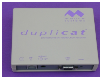
All receiver options feature all the connectors on one panel to aid installation of this compact enclosure. Dimensions: 130 x 100 x 30mm