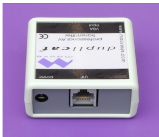
T-1 transmit unit is ultra-compact Dimensions: 65 x 65 x 28mm