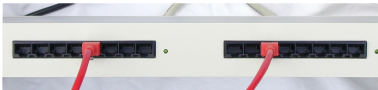
19" rack-mounted distribution amplifier (DA) products can also support lifesaver technology as well as point-point links. All screens are individually addressable - even with DA's.