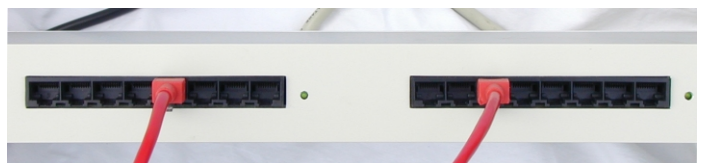
16-port DA (19" rack). 2 independant 8-way DA's form this 16-way system