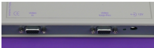
standalone DA showing loop-thru connection for video. Dimensions: 190 x 140 x 30mm

19" rack-mounting - choose between standalone DA systems or 1U 19" racks with integrated psu. All have active signal loop-thru